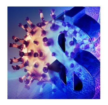
Retirees who took RMDs in 2020 have until August 31, 2020, to roll the money back into a qualified account. This rollover will not affect the one-rollover-per-year rule.

To be eligible for coronavirus-related provisions in the CARES Act, "qualified individuals" were originally defined as IRA owners and retirement plan participants who were diagnosed with the virus, those whose spouses or dependents were diagnosed with the illness, and account holders who experienced certain